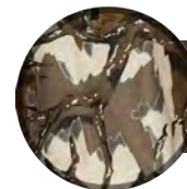
Predator Deception PN: 70326