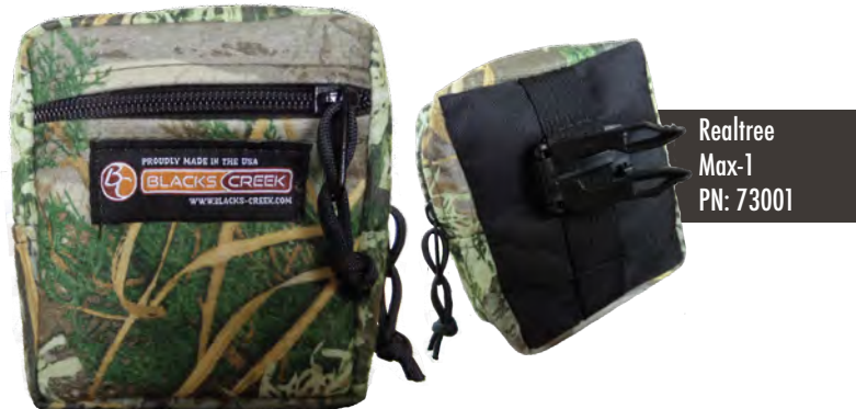
Realtree Max-1 PN: 73001