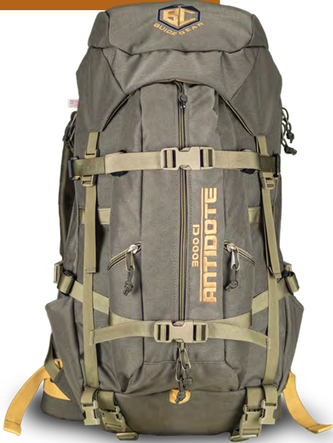
Ranger Green PN: 70301