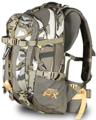
Predator Deception PN: 70422