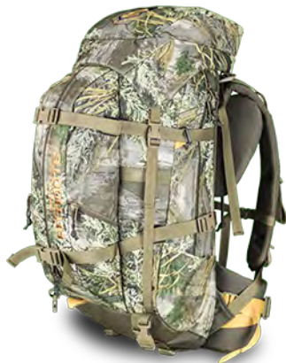
Realtree Max-1 PN: 70302