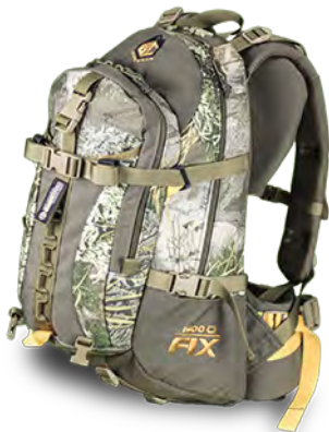
Realtree Max-1 PN: 70424