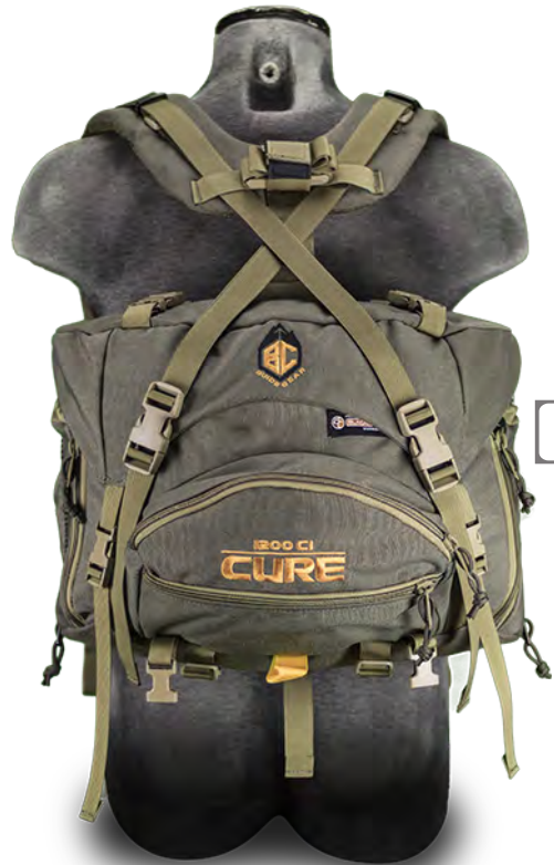
Ranger Green PN: 70318