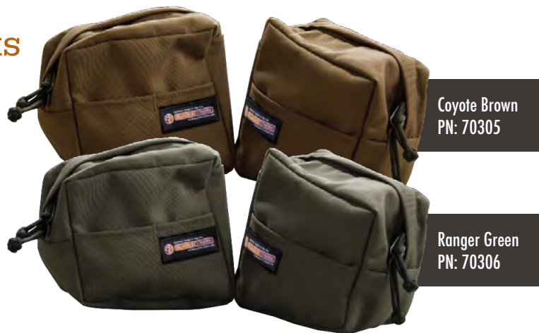
Coyote Brown PN: 70305