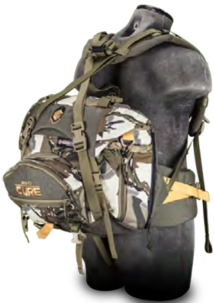
Predator Deception PN: 70320