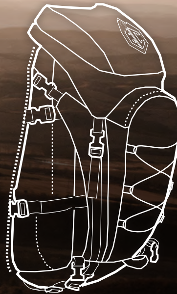
Grip Enabled Bag