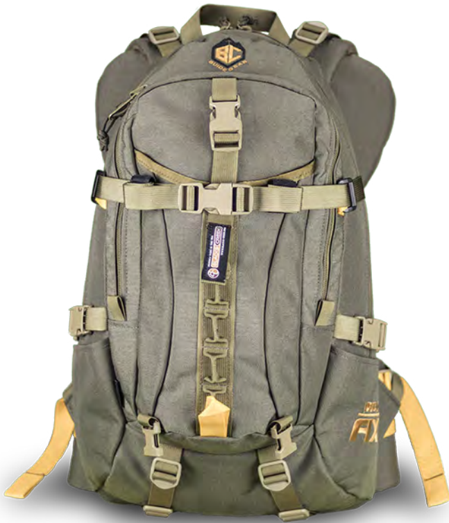
Ranger Green PN: 70423