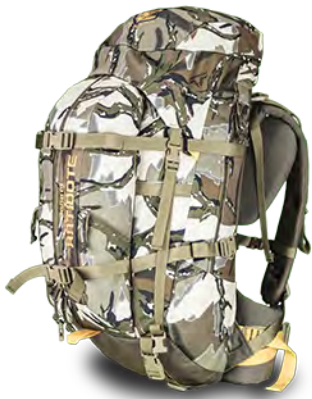
Predator Deception PN: 70299