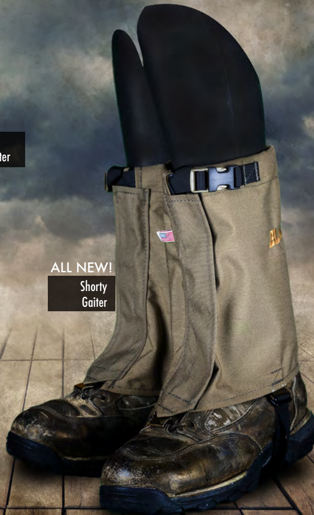
ALL NEW! Shorty Gaiter