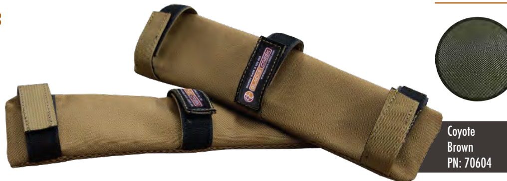
Ranger Green PN: 70603