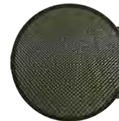
Ranger Green PN: 73003