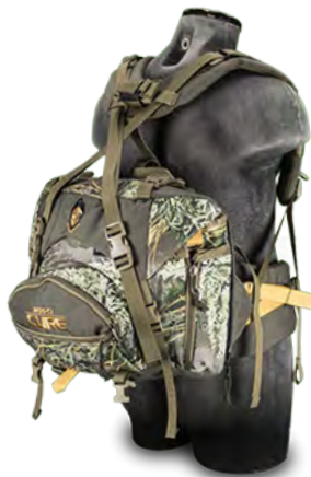
Realtree Max-1 PN: 70313