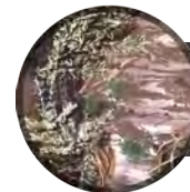
Realtree Max-1 PN: 70325